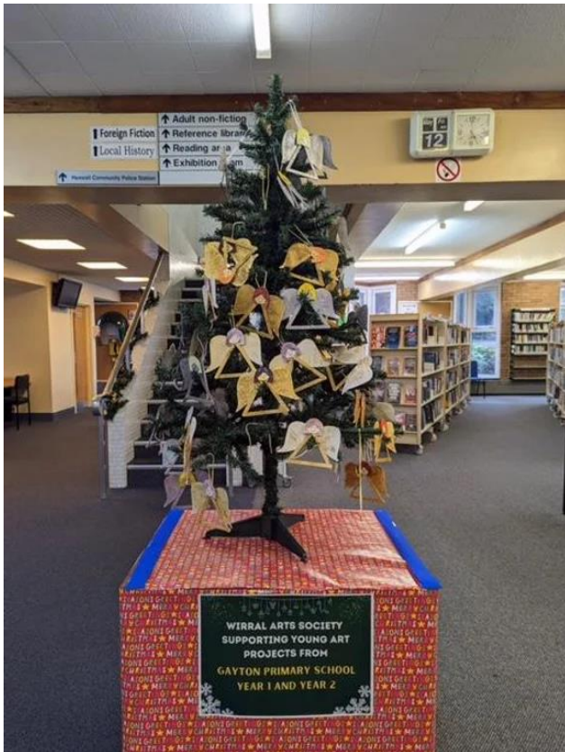
Christmas tree Heswall Library